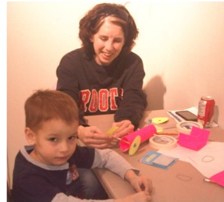
Photographs of TISP event

If you are interested in volunteering for this or other education outreach activities, please contact Murray MacDonald at 519-859-8723 or murraymacdonald@ieee.org